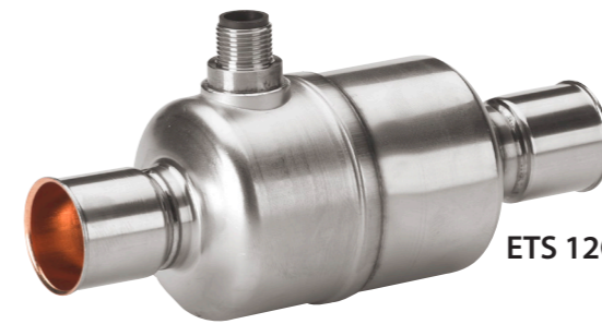
ETS 12C – ETS 24C

Today, ETS Colibri® is a result of our dedication and passion for engineering, built around uncompromised quality and performance. Its focus on energy efficiency ensues from placing great attention to our customers' needs.