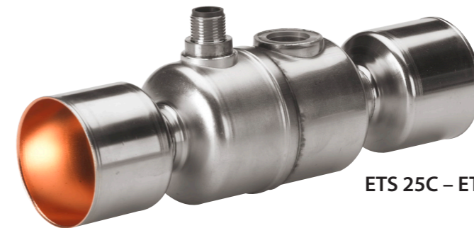
ETS 25C – ETS 50C – ETS 100C