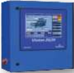
Figure 1 – Picture of Vilter Vission 20/20 Panel