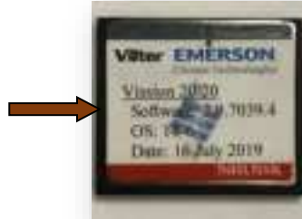
Figure 2 –Picture of affected Flash Card